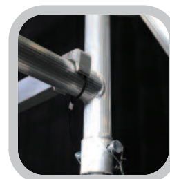
Brace Hook Frame Locking Pin