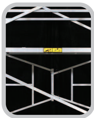
Folding Base Unit