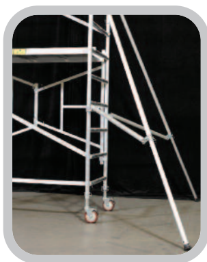
Outrigger Extension Pack