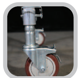
Adjustable Leg and Castor