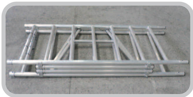
Folding Base Unit